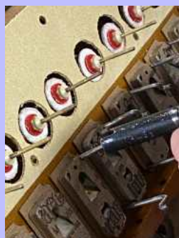
Closeup of the installed DAG screws.