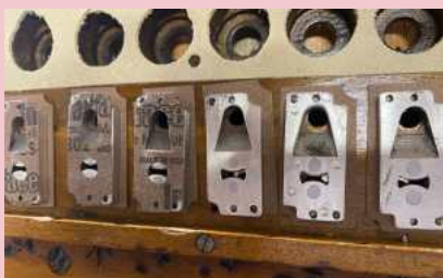
(left) three magnets with cap gaskets installed and three waiting their turn. (below) full bottom board with all magnet cap gaskets installed