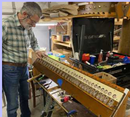
(above and right) Three views of a completed board with valves installed.