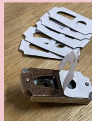
Peeling backing off of gasket. Using magnet cap as guide.