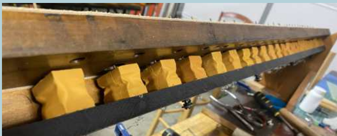
Close up view of the primary pneumatics installed on the primary rail of the bottom board.