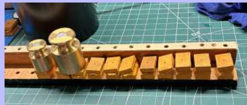
(above) Gluing primary pneumatics to the bottom board rail. We use weights to hold the primaries down until the glue sets.