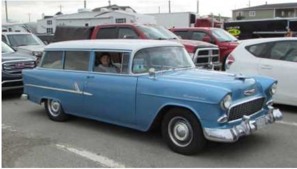
Jane in the passenger seat of the 55 Chevy as they board a ferry to Labrador.

mostly polar bears). They have been to Europe 4 times including mainland England, Scotland, Britain, Ireland, Netherlands, France, Germany, Switzerland, Norway, Portugal.