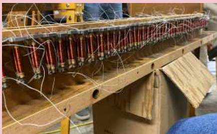
Magnets on the custom drying jig.