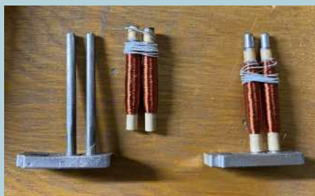
Original 1922 Magnet bases on the left next to a new coil. Finished assembly on the right.