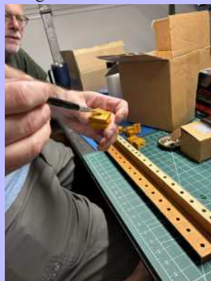
Gluing the individual primary pneumatics to the bottom board