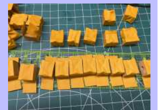
(Top) putting glue on the primary blanks